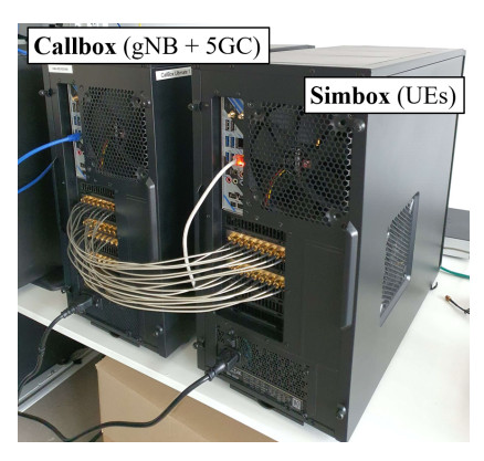
Fig. 2: Testbed deployment.

User equipments (UEs) sharing the same spectrum with different types of traffic within multiple cells. Each UE can be independently configured as a 5G NR device [4].