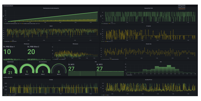
Fig. 3: Graphical User Interface.

A simplified example of our demonstration is available online<sup>1</sup>. This video presents the network performance of different deployed slices from our monitoring dashboard based on Grafana<sup>2</sup>. The possibility of acquiring instantaneous and effective resource allocation in network slicing is precluded due to the heterogeneous and dynamic characteristics of traffic requests. This scenario leverages a Multi-DRL mechanism to alleviate this challenge. Each agent deployed over the Callbox is equipped with a double deep Q-network (DDQN) [3] that,